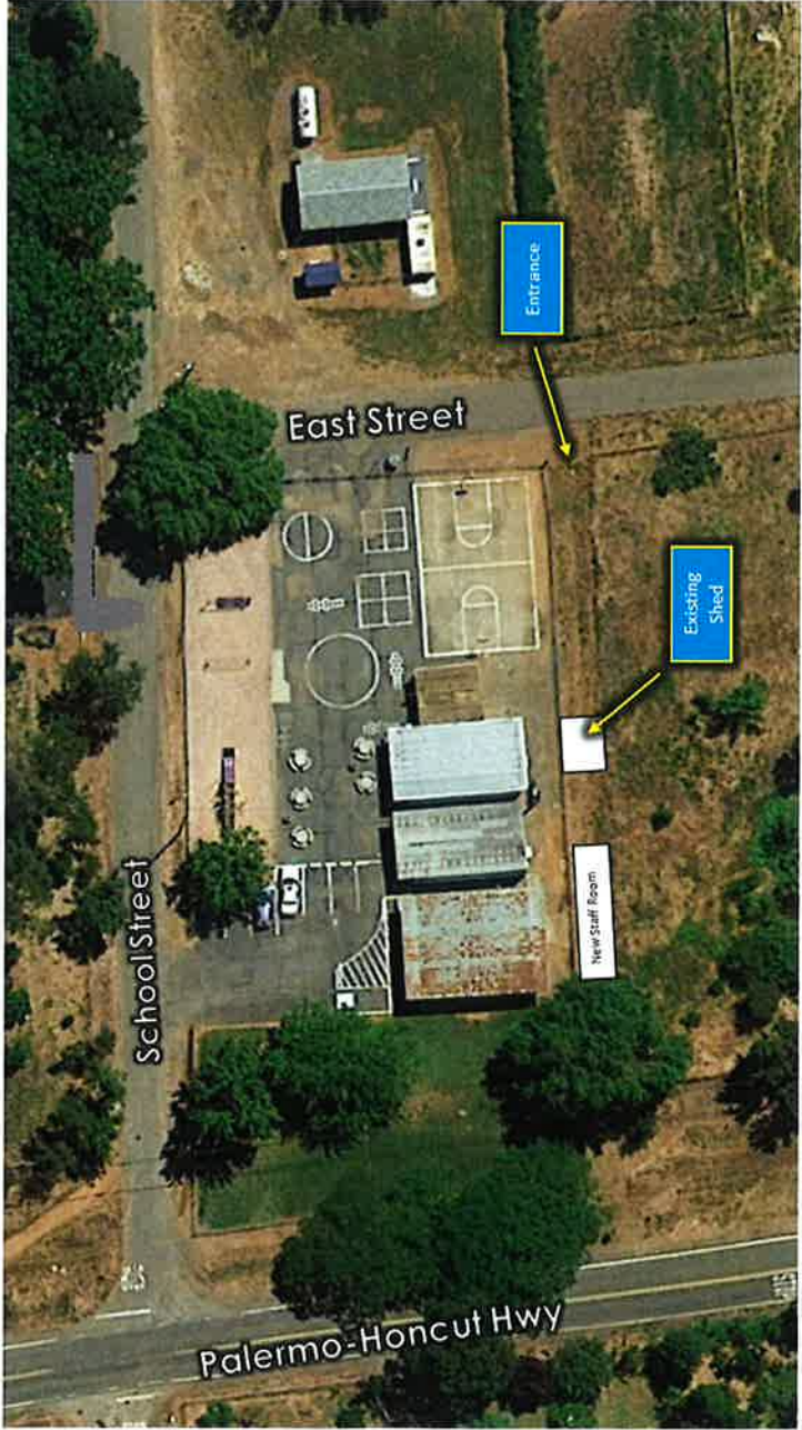
Honcut Elementary School