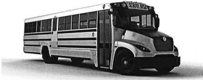
Z Lion AA2 AC Cost: $405,455.77 ($5,455.77 out of pocket) Passenger Capacity: 71