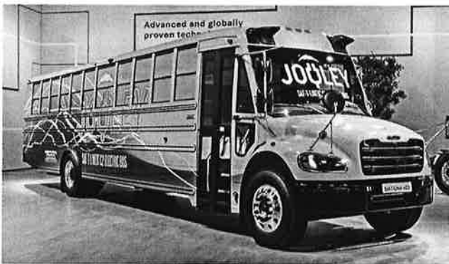
Thomas Saf-T-Liner eC2 Jouley Cost: $399,999.38 (no out of pocket) Passenger Capacity: 78