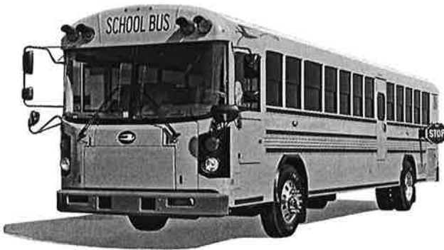
Blue Bird T3RE 3904 Cost: $399,598.46 (no out of pocket) Passenger Capacity: 78